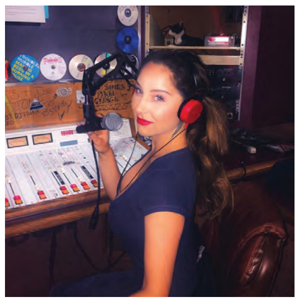
KSUN student DJ working on air

For communication majors interested in other media avenues, SSU also offers a television broadcast class (SSU-TV) and a weekly newspaper (the Star).