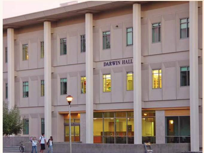
Above: Darwin Hall at twilight shows off a new beauty of the renovated building.

About 130 of the 190 full-time and part-time faculty, staff and administrators were displaced from Darwin Hall. They huddled in the southwest corner of the University library for 18 months as the building was stripped down to its bones and renovated with