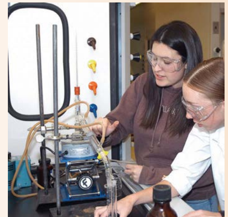
Right: New chemistry lab in Darwin Hall

safety, energy efficiency and sustainability in mind.