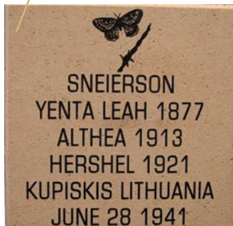
Above: Memorial Bricks will serve as railroad ties and can be purchased in two sizes.

Tears will shine in the eyes of those who come after us