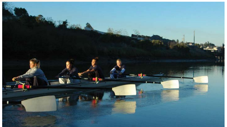
Early morning rowing on the Petaluma River

The team is poised for another great season in this the fourth year of competition. The varsity women have their sights set on keeping their WIRA trophy and are working to become an NCAA recognized sport. The men will battle schools like UC Davis and Stanford to maintain a reputation as one of the most successful young programs in the western United States. The club is also working with the school to create on-campus land training facilities and hopes to break ground on a new aquatic center on the Petaluma River within five years.