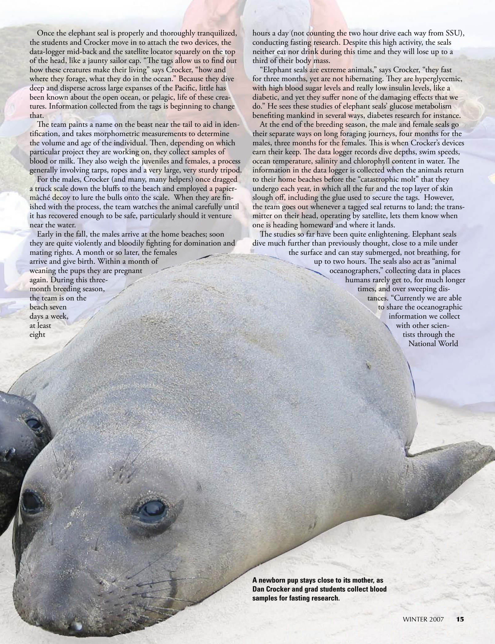
A newborn pup stays close to its mother, as Dan Crocker and grad students collect blood samples for fasting research.

The studies so far have been quite enlightening. Elephant seals dive much further than previously thought, close to a mile under the surface and can stay submerged, not breathing, for up to two hours. The seals also act as "animal oceanographers," collecting data in places humans rarely get to, for much longer times, and over sweeping distances. "Currently we are able to share the oceanographic information we collect with other scientists through the National World