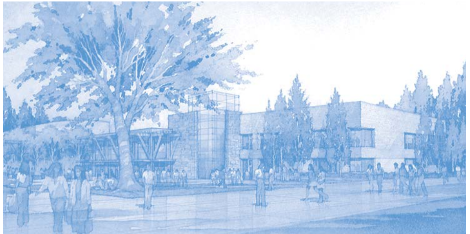
Anticipated completion of the Student Recreation Center is April 2004.

Construction of the Recreation Center is made possible through the Sonoma Student Union, a non-profit auxiliary corporation of Sonoma State