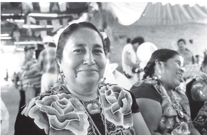
The Sonoma Film Institute hosts many independent filmmakers, who join audiences at showings of their work. One independent film to receive an SFI screening was Blossoms of Fire , above.

"We've got 100 years of films to work with, so eventually, there really is something for everyone." ■