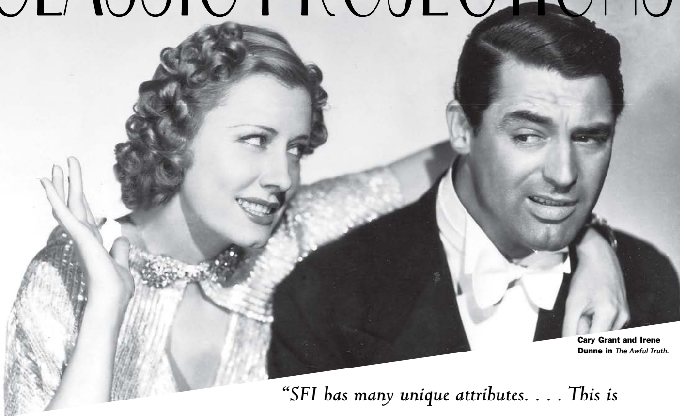
Cary Grant and Irene Dunne in The Awful Truth .

“SFI has many unique attributes. . . . This is the only theater in the county that has a Periodic Table of the Elements on the wall.”