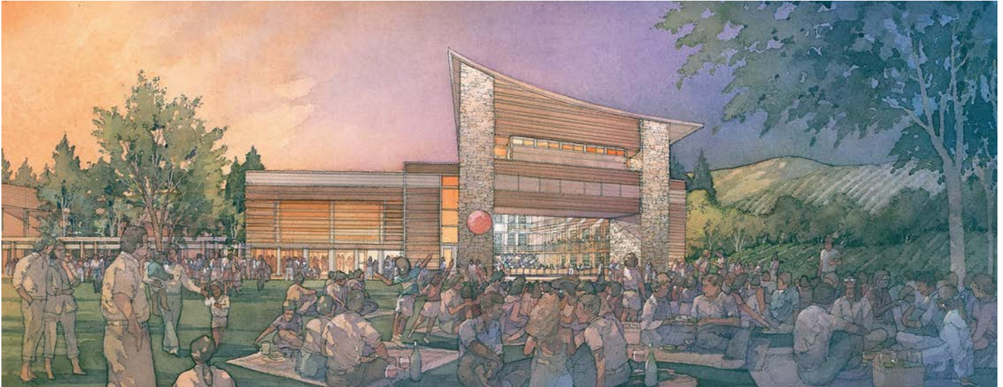
Artist's rendering of the Concert Hall of the Green Music Center.